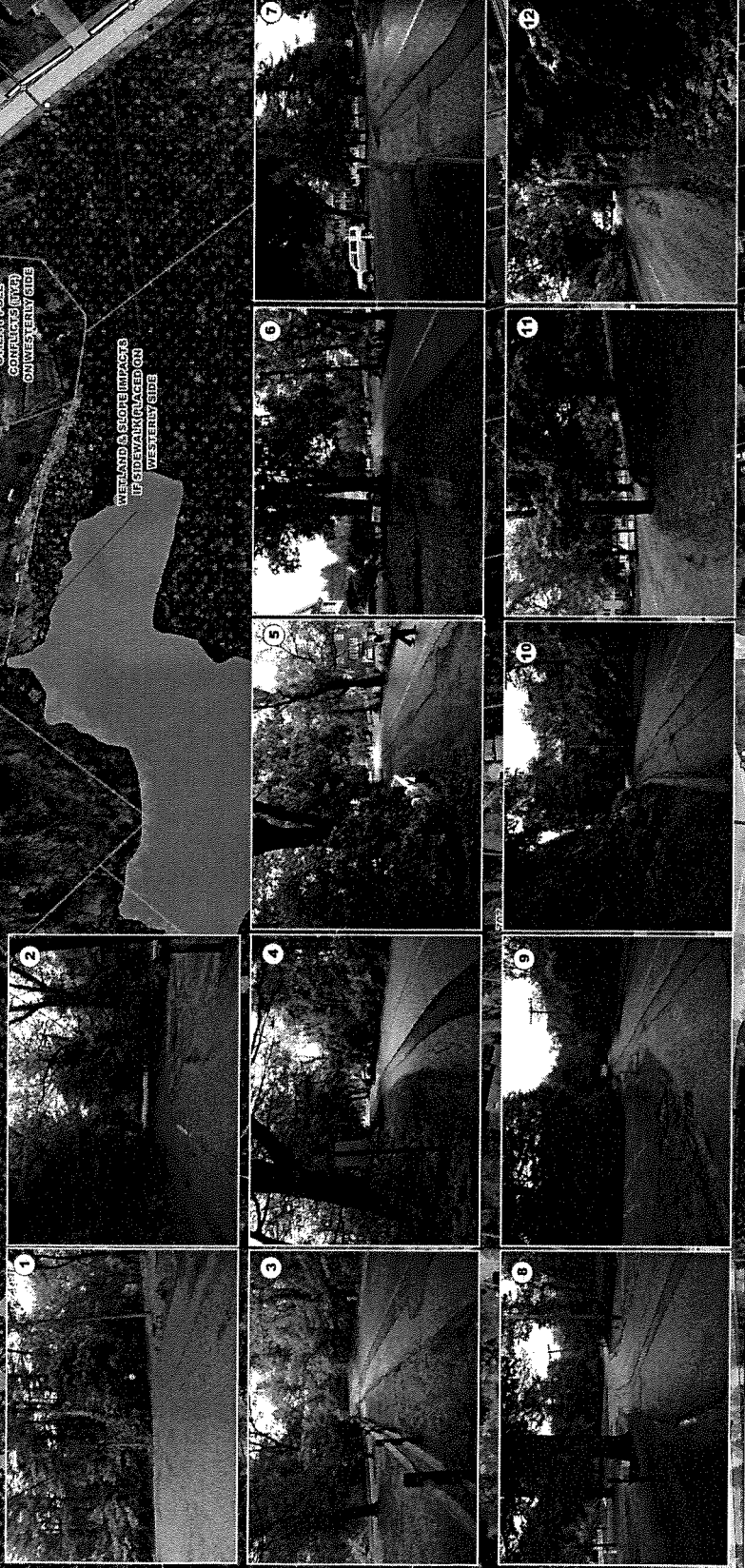
Document Path: W:\Project\Warren\Warren_Proposed Sidewalk_18.dwg